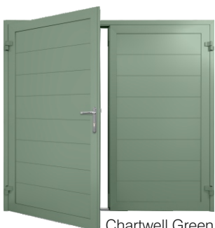
Chartwell Green BS 14 C 35