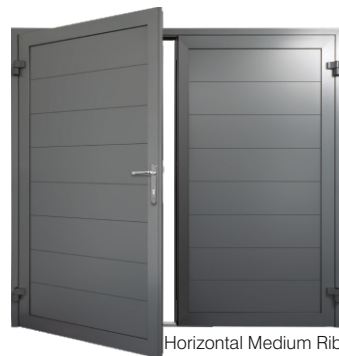
Horizontal Medium Rib