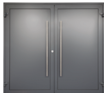
Solid shown closed