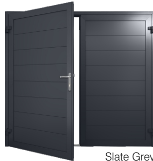
Slate Grey RAL 7015