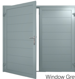
Window Grey RAL