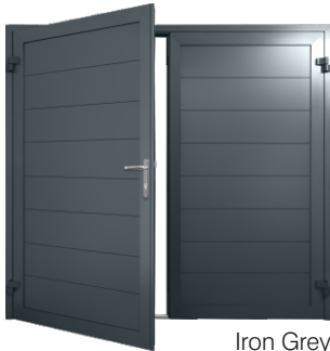
Iron Grey RAL 7011