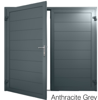
Anthracite Grey RAL7016