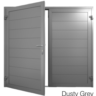
Dusty Grey RAL 7037