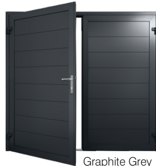
Graphite Grey RAL 7024