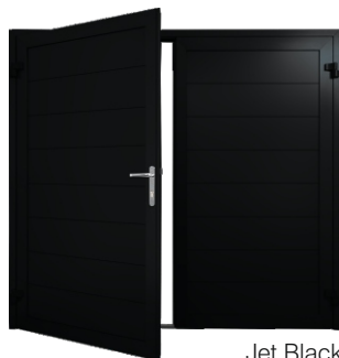
Jet Black RAL 9005