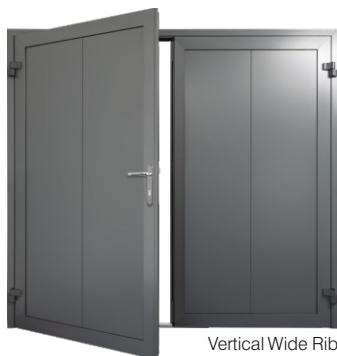
Vertical Wide Rib