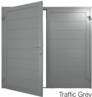
Traffic Grey RAL 7042