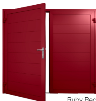
Ruby Red RAL 3003