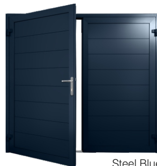
Steel Blue RAL5011