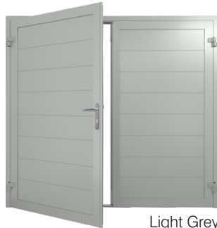
Light Grey RAL 7035