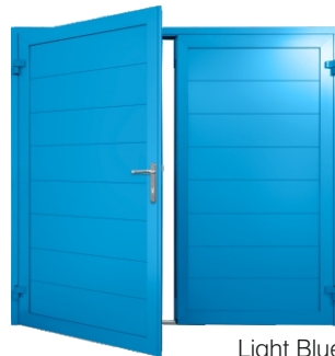
Light Blue RAL 5012