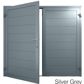
Silver Grey RAL 7001