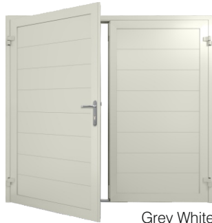
Grey White RAL 9002