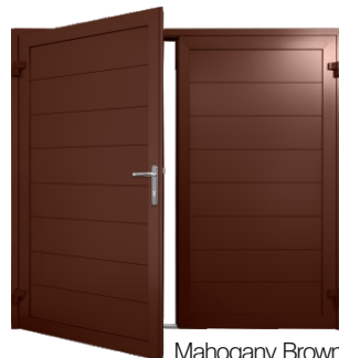
Mahogany Brown RAL 8016