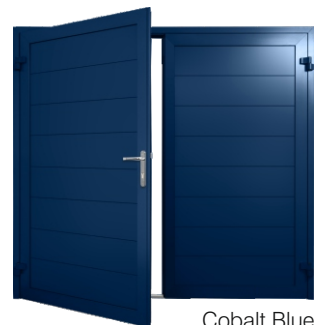
Cobalt Blue RAL 5013