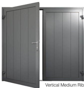
Vertical Medium Rib