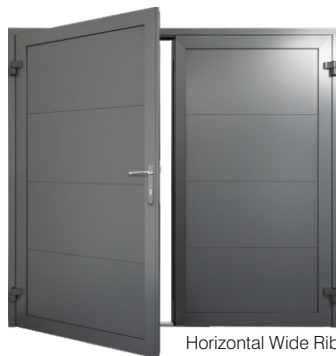
Horizontal Wide Rib

Transform your home's curb appeal with our exquisite insulated side-hinged garage doors. Choose from our diverse panel designs featuring horizontal or vertical ribs, and elevate your garage's look with a modern or classic handle.