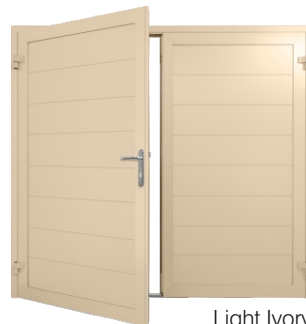
Light Ivory RAL 1015