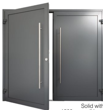
Solid with 1500mm pull bars (1200mm also available)