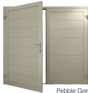
Pebble Grey RAL 7032