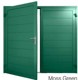
Moss Green RAL6005