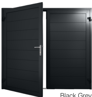
Black Grey RAL 7021