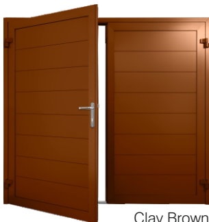
Clay Brown RAL 8003