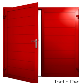
Traffic Red RAL 3020