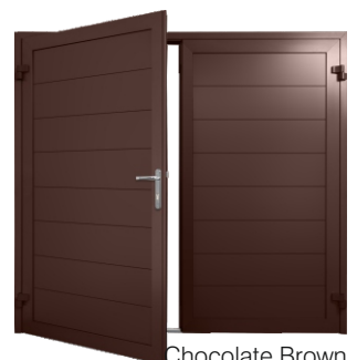
Chocolate Brown RAL 8017