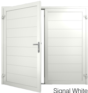
Signal White RAL 9003

long-lasting beauty, and all doors feature colour-matched hinges for a seamless look.