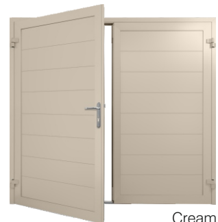
Cream RAL 9001