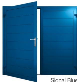
Signal Blue RAL 5005