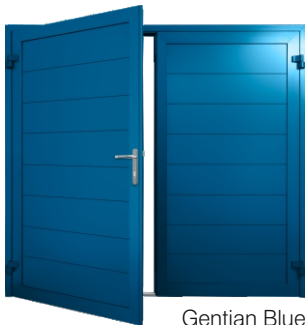
Gentian Blue RAL 5010